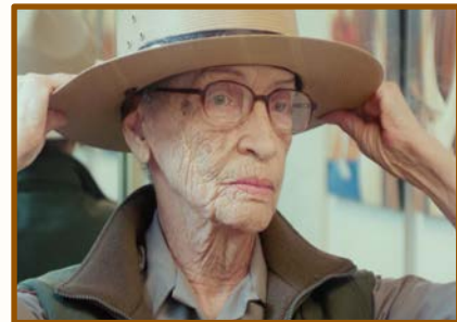
Clip from No Time To Waste: The Urgent Mission of Betty Reid Soskin , Bullfrog Films, March 9, 2021